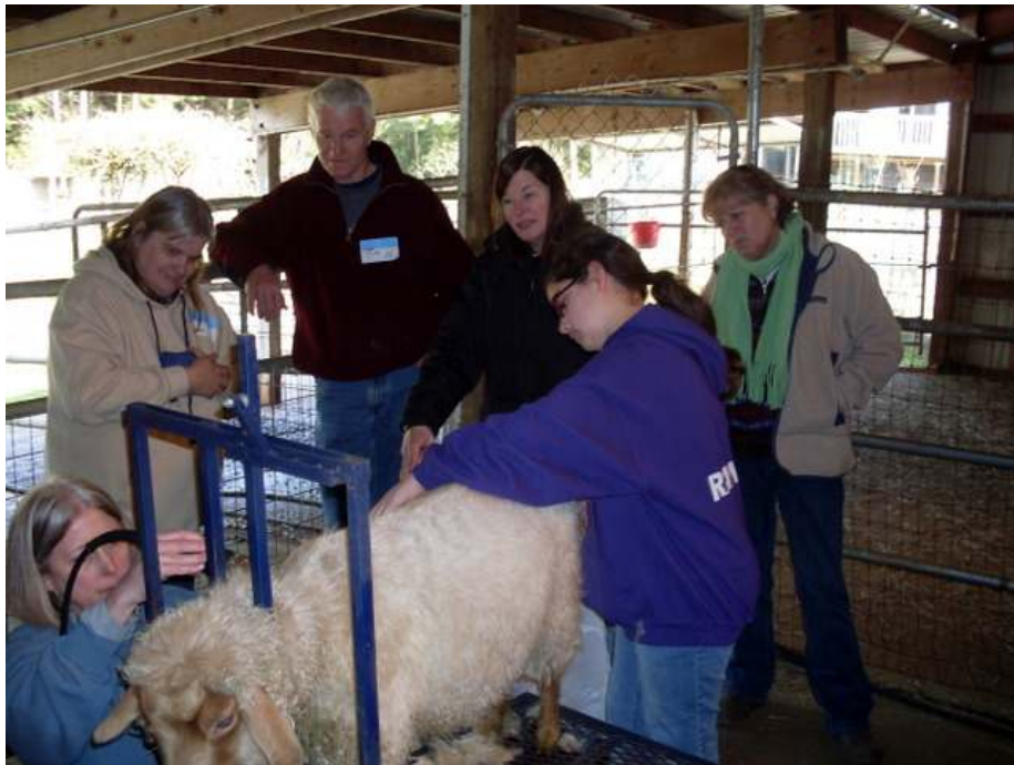
Shearing in process