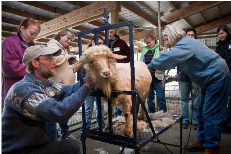
Working the back end